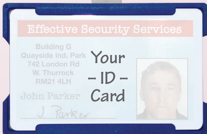
3 CARDH 86x55