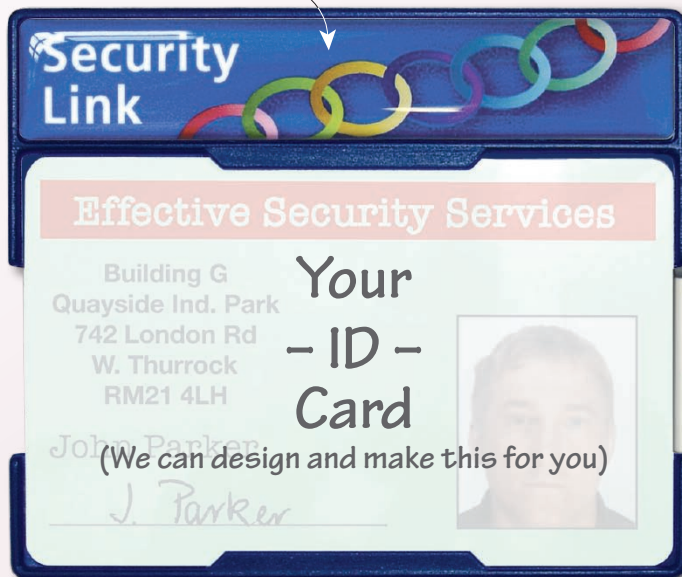
1 IDHN 86x54 (Landscape)