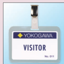
4 IDSTRAP 85x54 (Landscape)