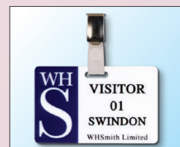
5 Card (Punched)