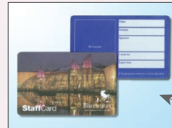
Example showing front and rear, ready for you info.