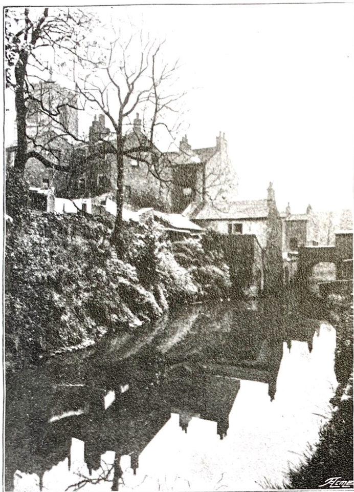
Canal Bank, Skipton.