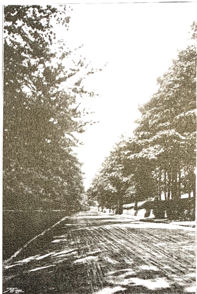
Promenade, Gargrave Road, Skipton.