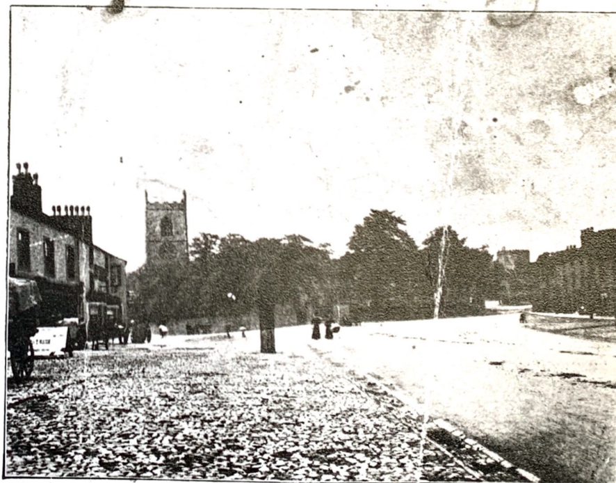
HIGH STREET, SKIPTON.

Issued under the Patronage of The Skipton Urban District Council.